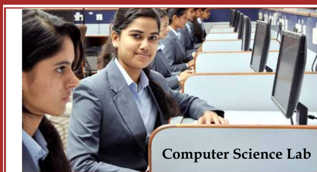
Computer Science Lab